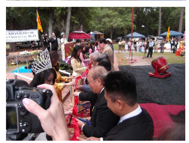
Veiling the Statue * Miss Florida and UCF students present the Allied country's flags in Vietnam War * Presentation of Colors and Salutation ceremony * The President of the Vietnamese-American Memorial welcome guests